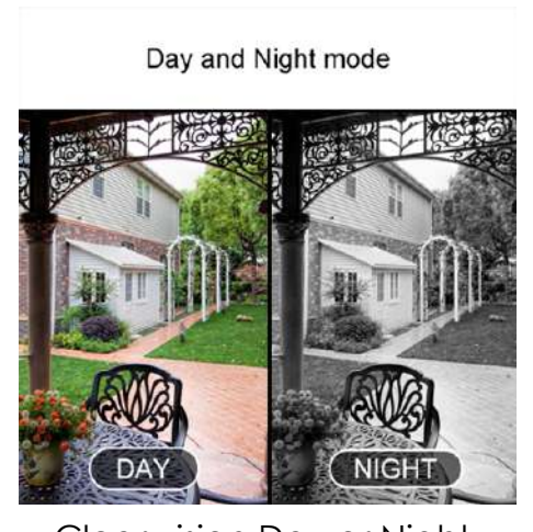
Clear vision Day or Night