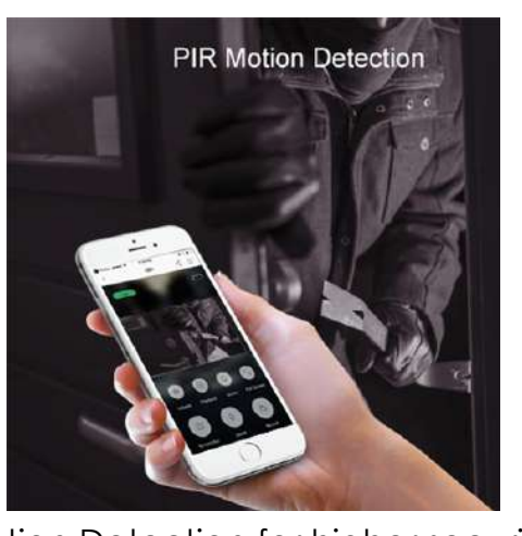
Motion Detection for higher security